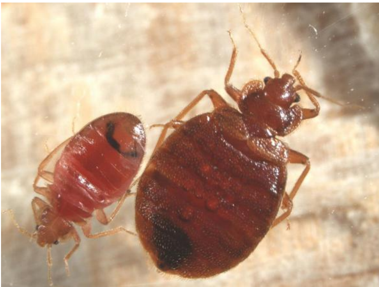
Fig 2 Bed bug nymph (1-4 mm) and adult (5-7 mm): Cimex lectularius