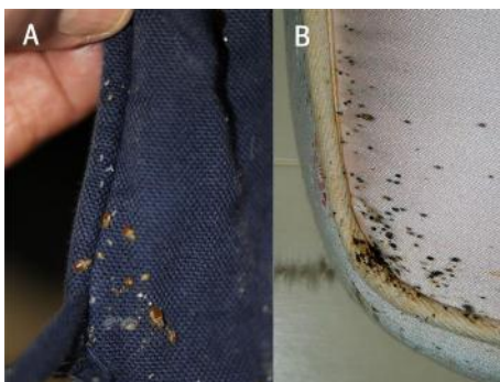
Fig 4 To educate patients to the “search and destroy” strategy, GPs should show them pictures of (A) bed bugs and their typical hideouts and (B) bed bug faecal traces on the mattress