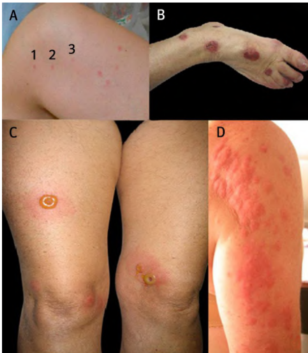
Fig 3 Clinical manifestations of bed bug bites: three or four skin lesions are often seen in a “breakfast (1), lunch (2), dinner (3)” distribution (A) or “wheel” distribution (B). Atypical bullous lesions (C) and urticaria (D)